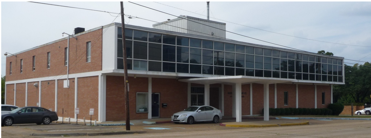
Figure 1 - Current Board Office Location

The Board currently operates with a staff of four, which includes the Executive Director. The Board is advised and supported by an Assistant Attorney General. The Board has operated in several different state-provided facilities over the years. In June 2024, the Board office relocated to the Old Barefield Complex in downtown Jackson. (See image below.) The current Board address is 455 North Lamar Street, Suite 208, Jackson, MS.